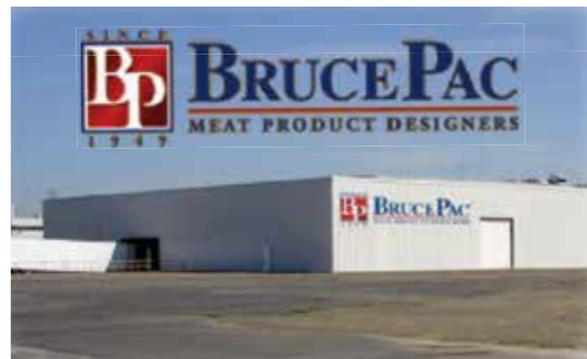
TEMPO® Implementation at BrucePac: Technical Time on TEMPO® vs Base Plating Methods

After meeting with representatives from bioMérieux in the fall of 2010, BrucePac management decided to implement the TEMPO solution for the following routine parameters: total aerobic count, coliforms, Escherichia coli , and coagulase-positive Staphylococcus aureus .